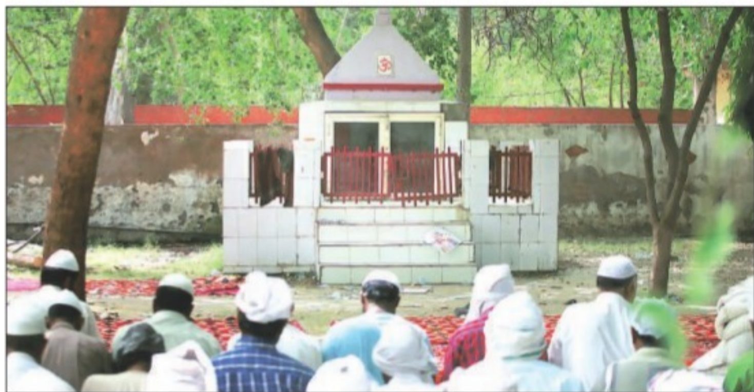
Muslims offer prayer at the Ballabgarh police station on Thursday.